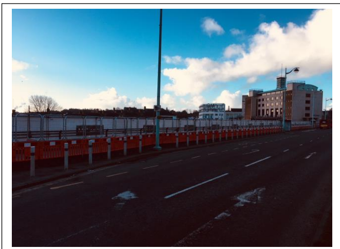
Closure of footpath on viaduct complete.