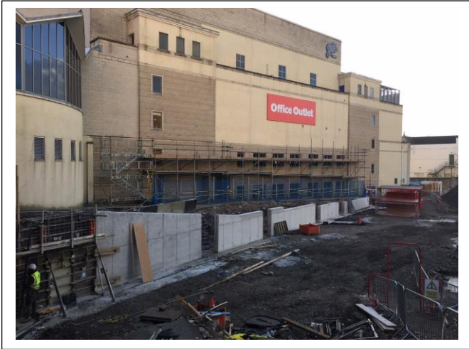
Retaining wall preparation at Gala Bingo perimeter.