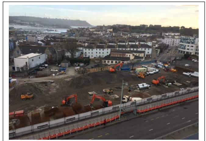
View from Primark