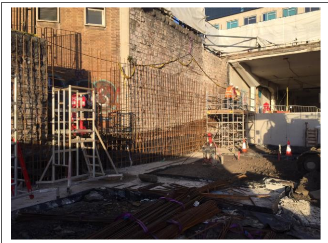
Retaining wall to RBS perimeter ongoing.