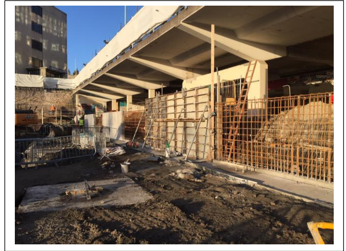
Preparation work ongoing to the retaining wall along the viaduct.