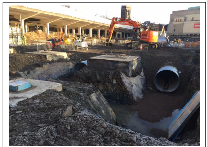
Tubosider attenuation tank installation ongoing.