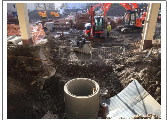
Deep drainage works to undercroft commenced.