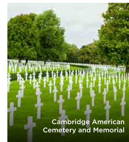
Cambridge American Cemetery and Memorial