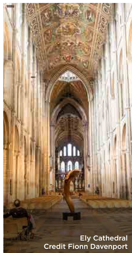
Ely Cathedral