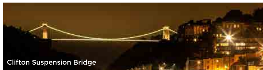
Clifton Suspension Bridge