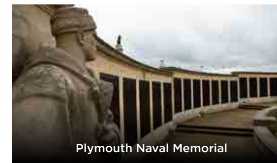
Plymouth Naval Memorial