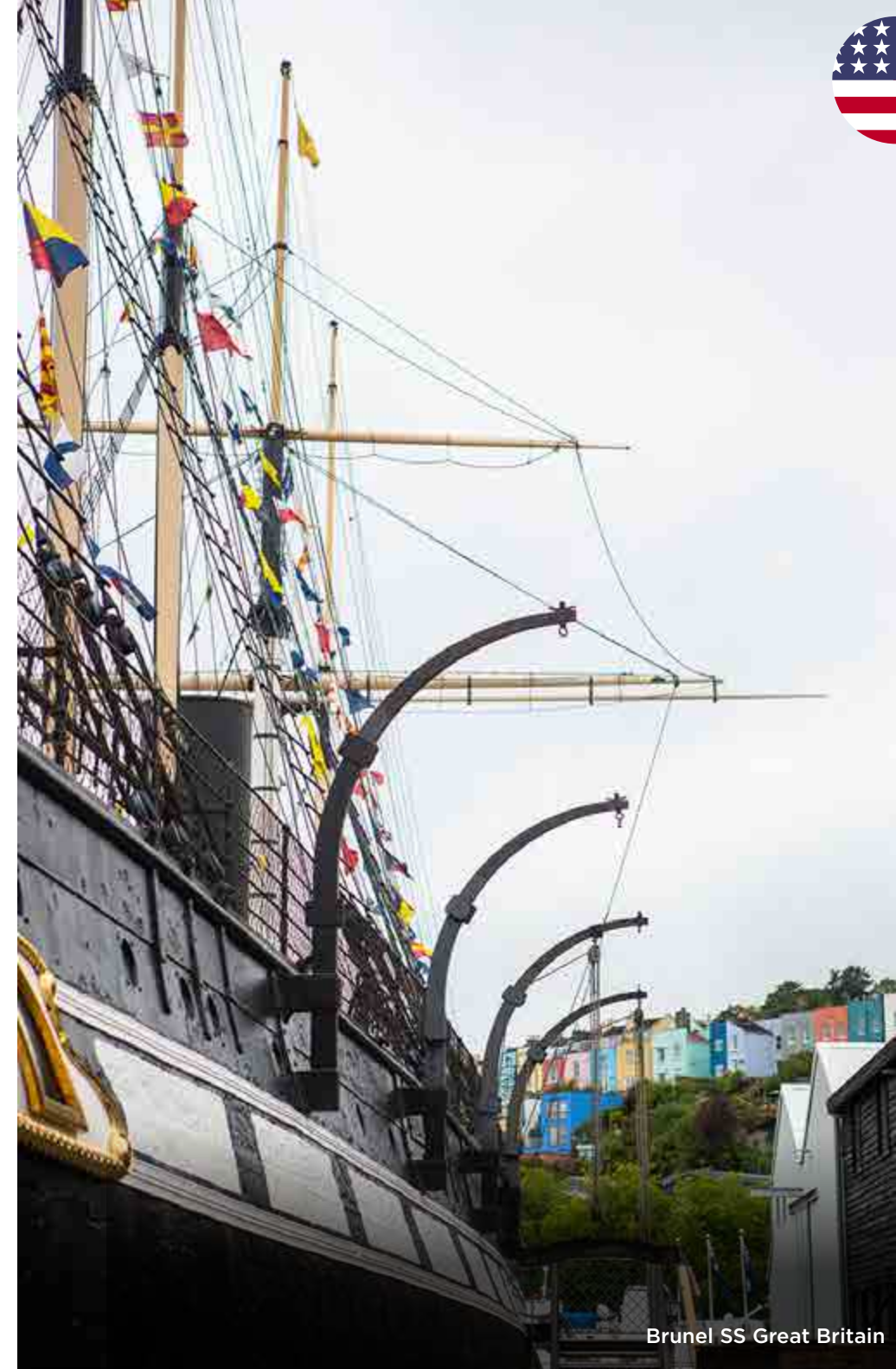
Brunel SS Great Britain