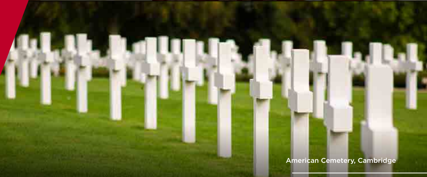
American Cemetery, Cambridge