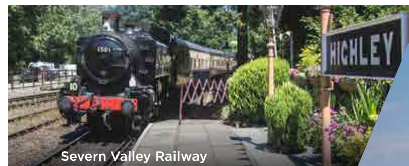
Severn Valley Railway

In 1875, US demand for Lea & Perrins Worcestershire Sauce was so high it had to be imported in casks. It wasn't manufactured in the US until 1902.