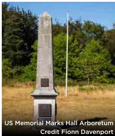
US Memorial Marks Hall Arboretum