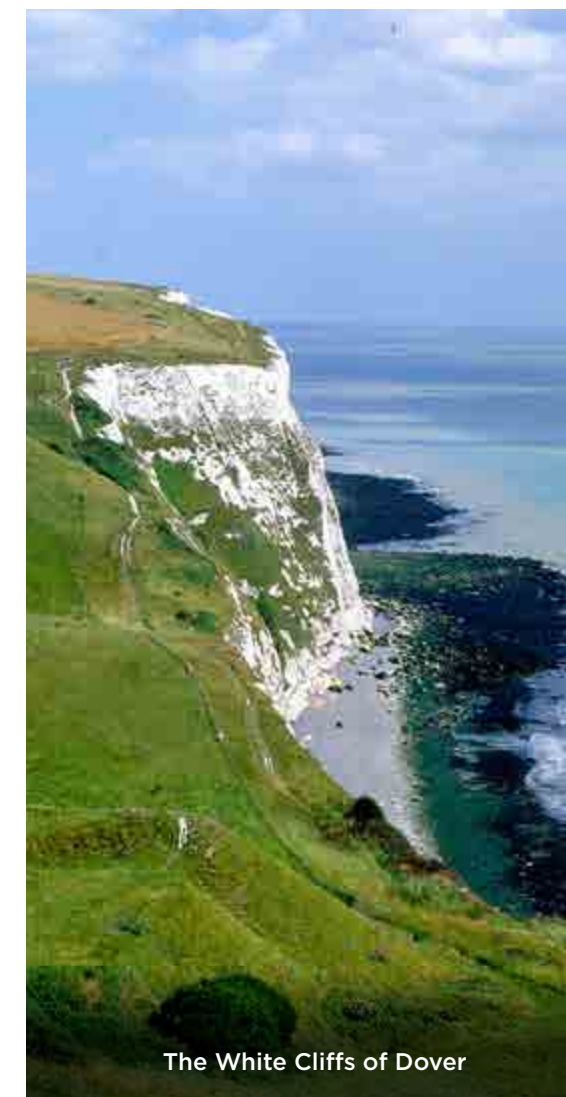
The White Cliffs of Dover