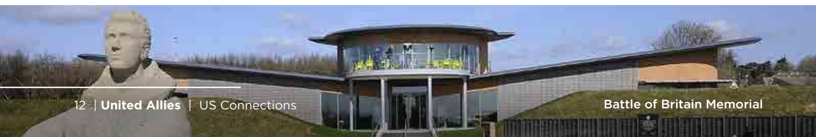
Battle of Britain Memorial