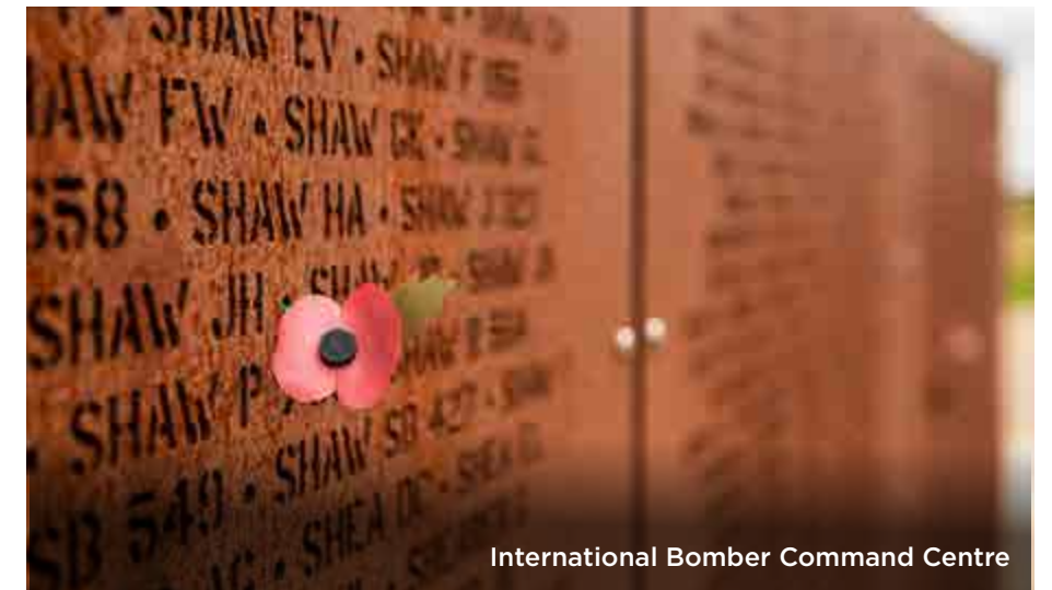
International Bomber Command Centre