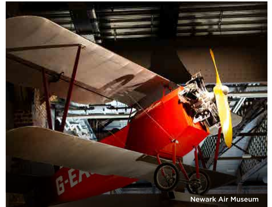
Newark Air Museum