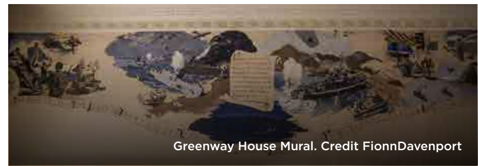
Greenway House Mural.