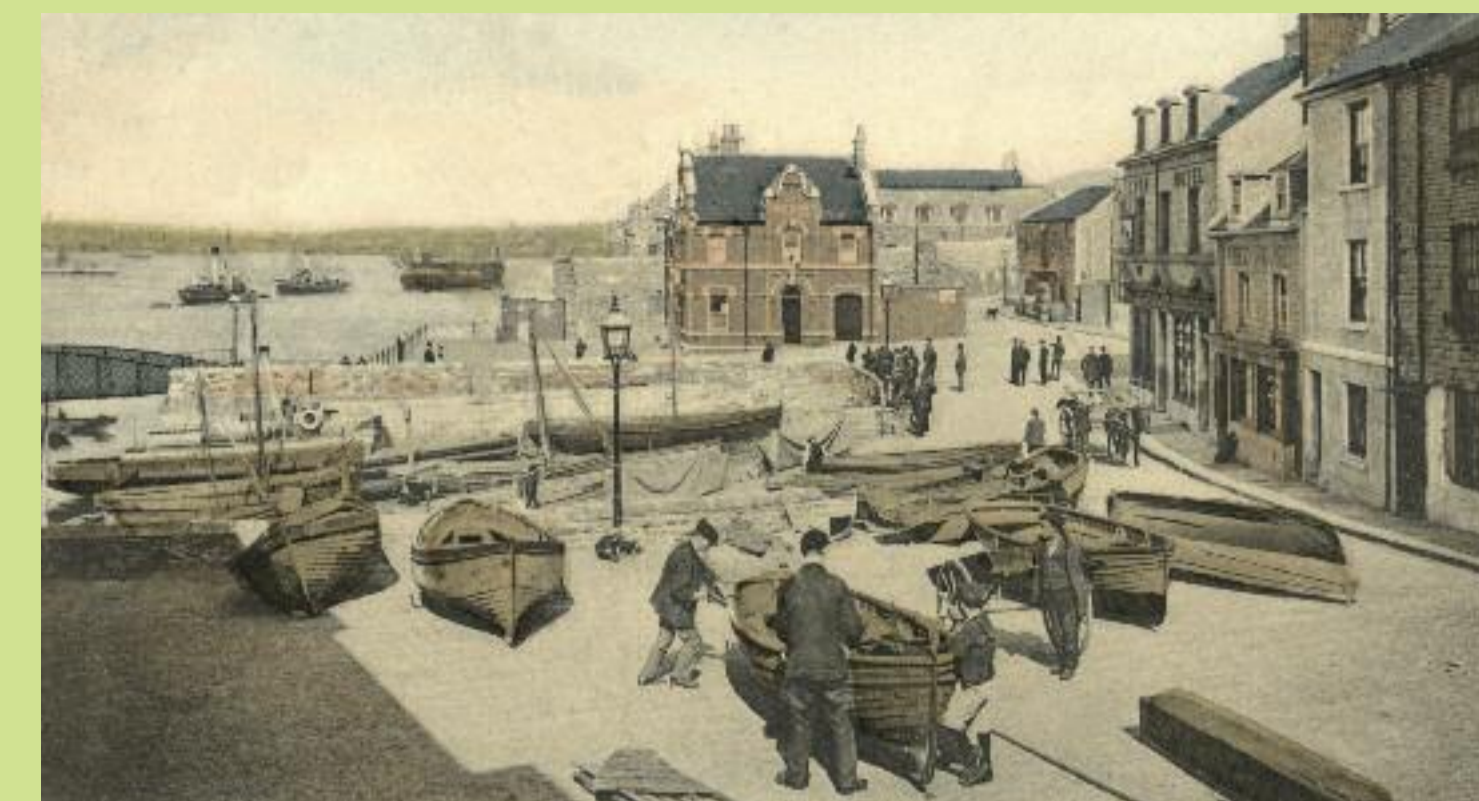
Cornwall Beach and North Corner, c.1905