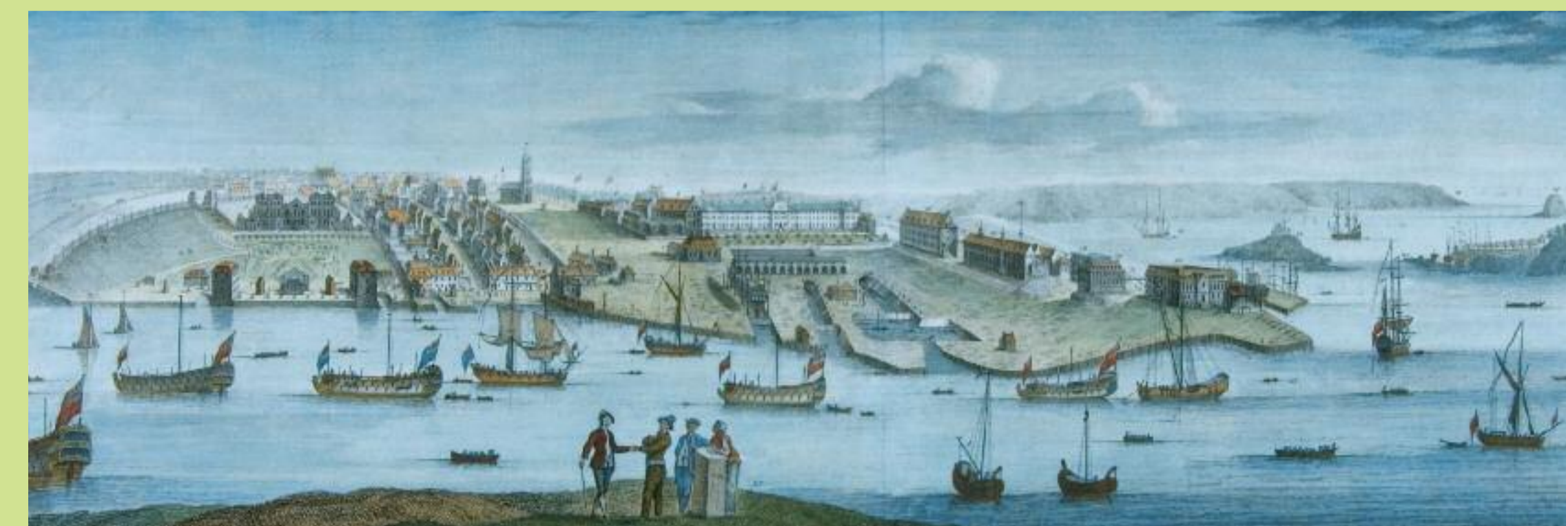
North Corner and Plymouth Dock, from Torpoint, 1736 Plymouth City Museum & Art Gallery

The Heritage Trail continues down New Passage Hill and into Devonport Park. In 1788-9 this was a new road, cut through the 'Dock Line' defences to serve the growing town. New Passage Hill also provided a connection to the Torpoint Ferry, established in 1791. A Trail-spur takes in Pottery Quay and an artwork by David Harbott. The floating bridge ferries cross regularly to Torpoint and Cornwall.