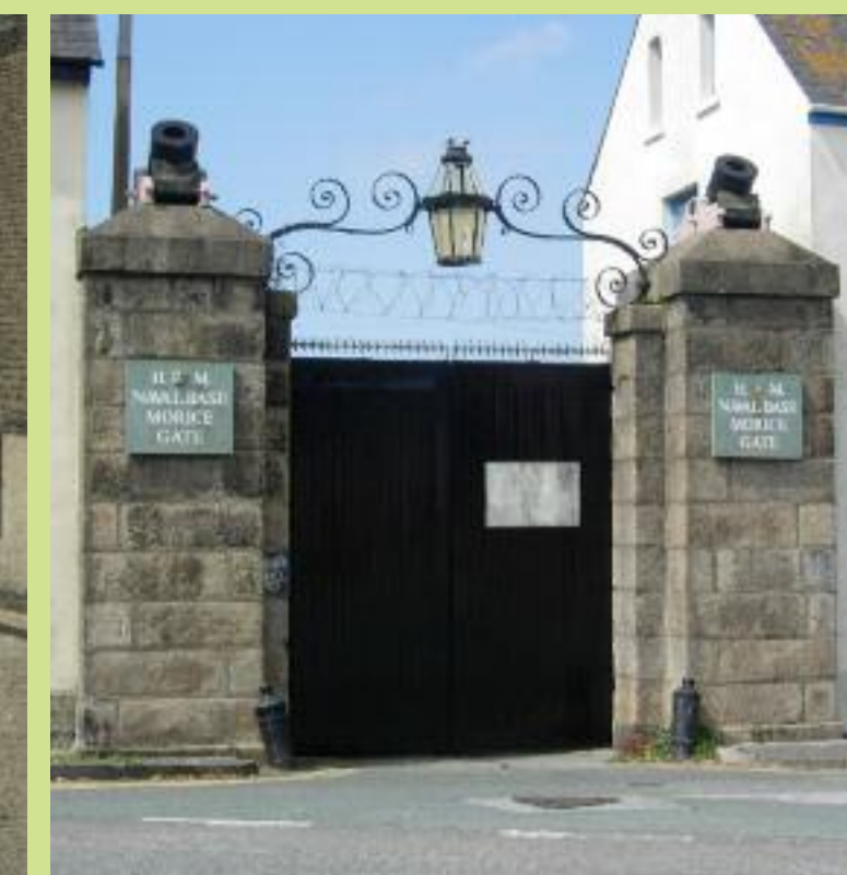
Morice Yard Gates, 2008