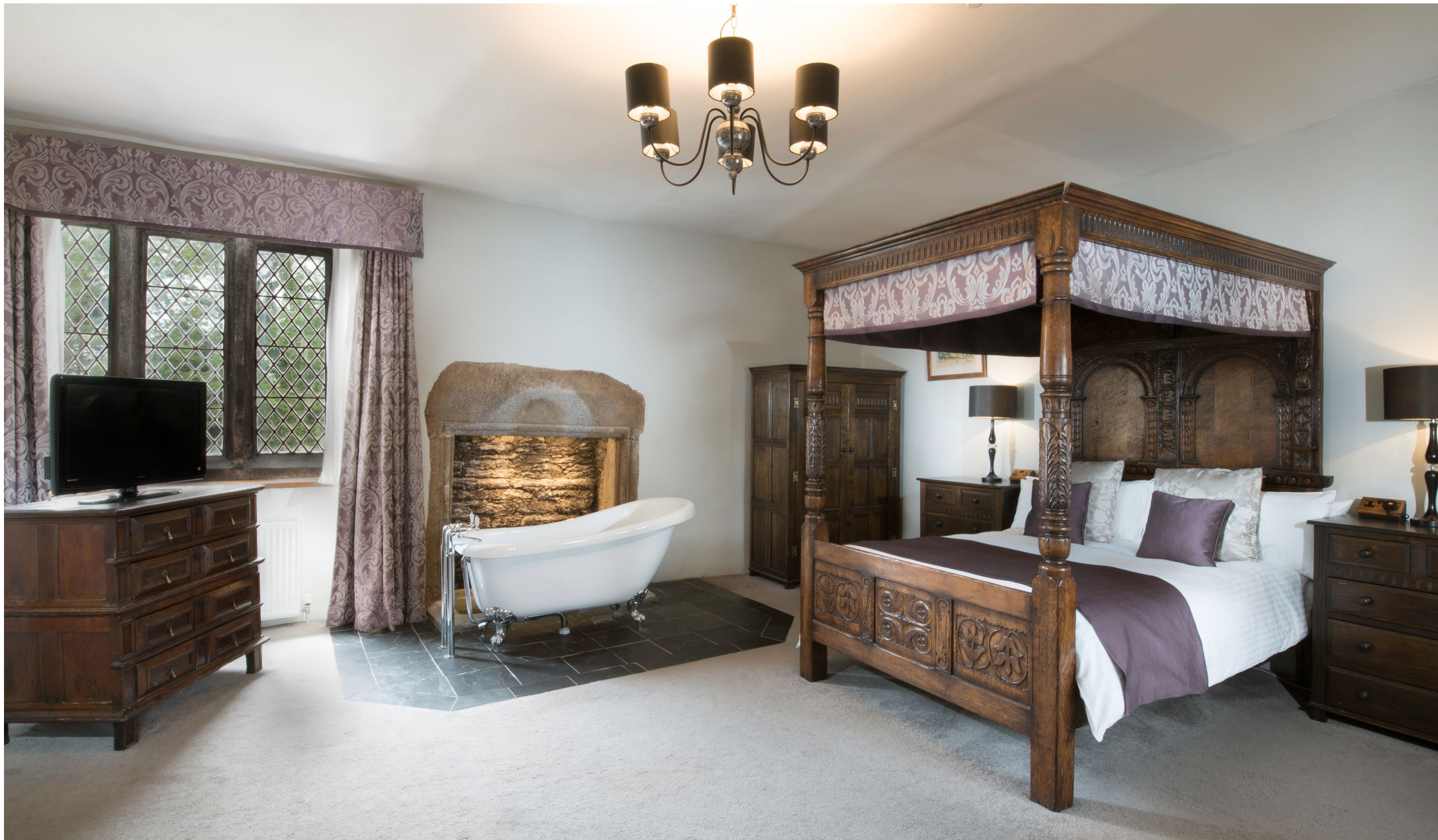
• Four Poster Room