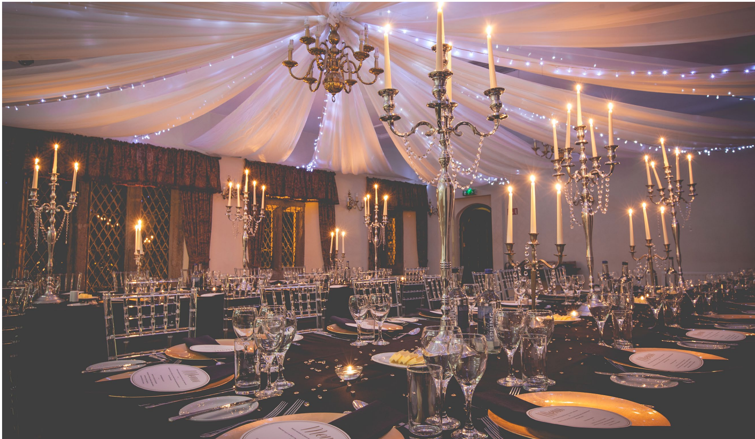
• Elizabethan Suite