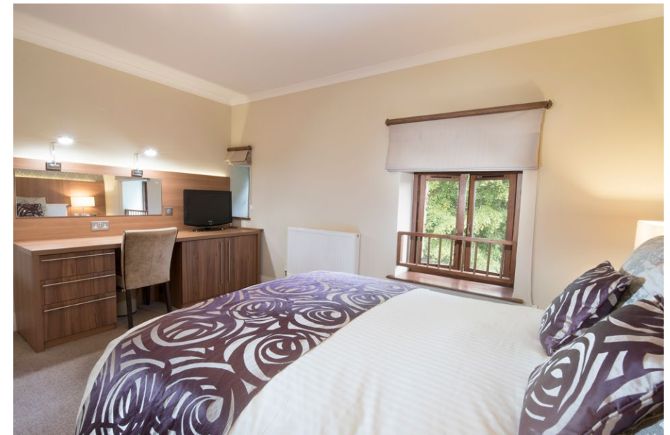
• Top; Courtyard Room | Bottom; Stable Room