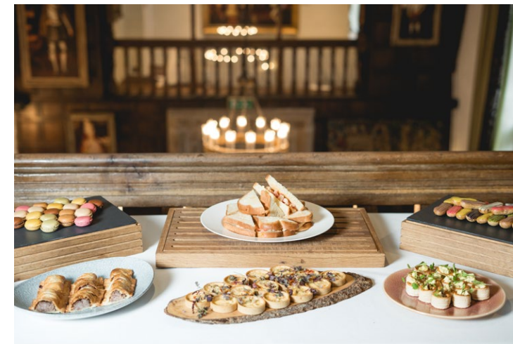
Left - Traditional afternoon tea Right Top - Cheese selection in the Gallery Restaurant Right Bottom - Finger buffet