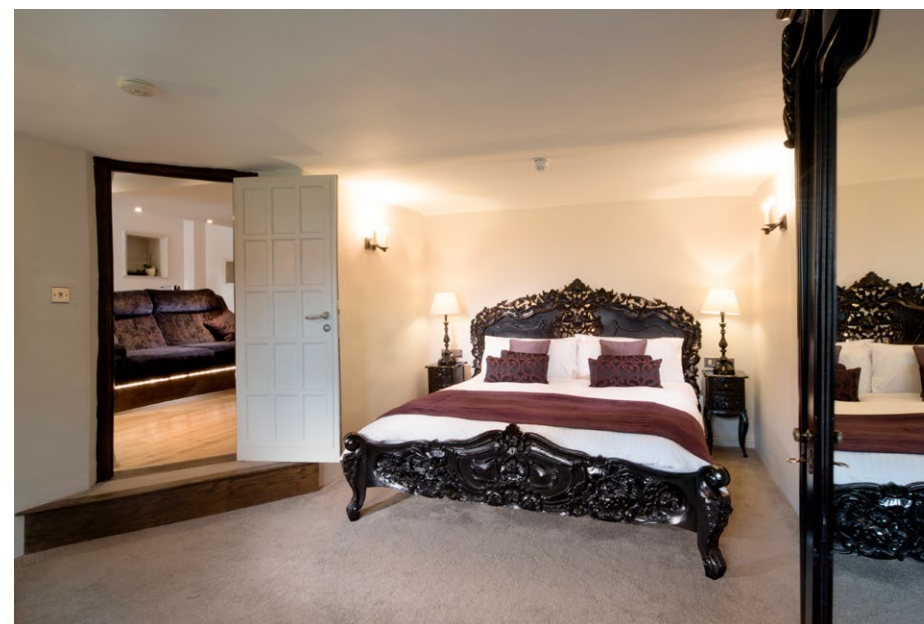
• Royal Suite