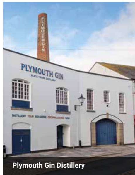
Plymouth Gin Distillery

(1 hour approx.) Take a tour around Black Friars distillery, the home of Plymouth Gin and the UK’s oldest gin distillery, where it is believed that the Mayflower Pilgrims stayed before their voyage. Sample the award-winning Plymouth Gin in the distillery’s historic bar.