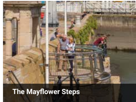
The Mayflower Steps

Plymouth Hoe (1 hour approx.) Follow in the footsteps of Sir Francis Drake and gaze out over the magnificent Plymouth Sound – one of the world’s finest natural harbours. For a 360 degree view climb the 93 steps of the iconic Smeaton’s Tower to see Plymouth’s stunning waterfront, city centre and countryside.