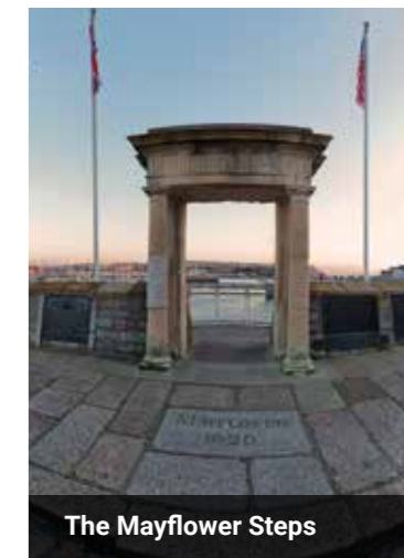
The Mayflower Steps

Visitors can explore this historic city with its spectacular sea views, which lies in the South West of England. It has the perfect blend of vibrant city culture, coast and countryside. It is where Sir Francis Drake, on hearing the news of the approaching Spanish Armada, famously finished his game of bowls on Plymouth Hoe before setting sail to defeat them in 1588.