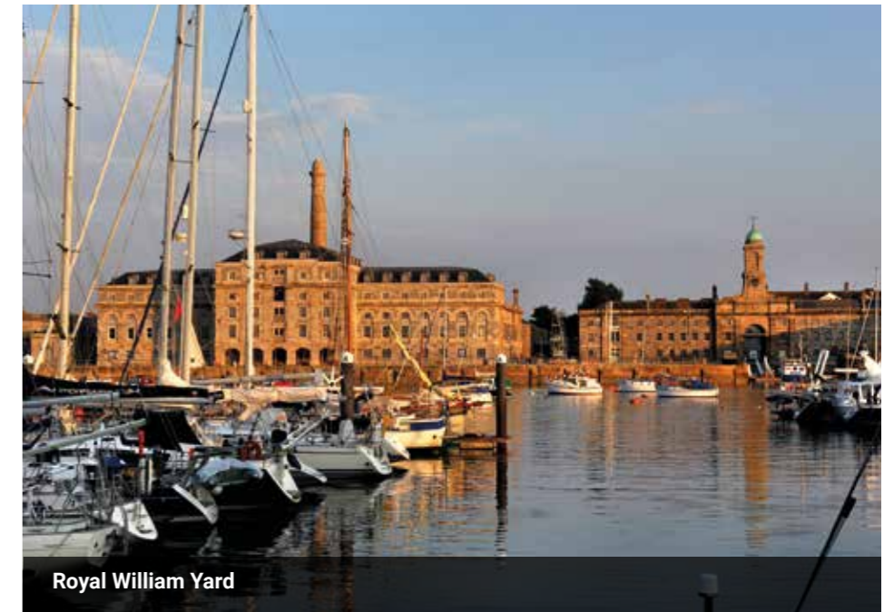
Royal William Yard

Take a tour of Grade I listed Royal William Yard, former Royal Naval victualling buildings which now boasts a plethora of cafés, bars and restaurants including Le Vignoble which offers wine tasting and over 250 different wines, champagnes and liqueurs from all over the world. You will also visit Ocean Studio’s artisan café, the Column Bakehouse.